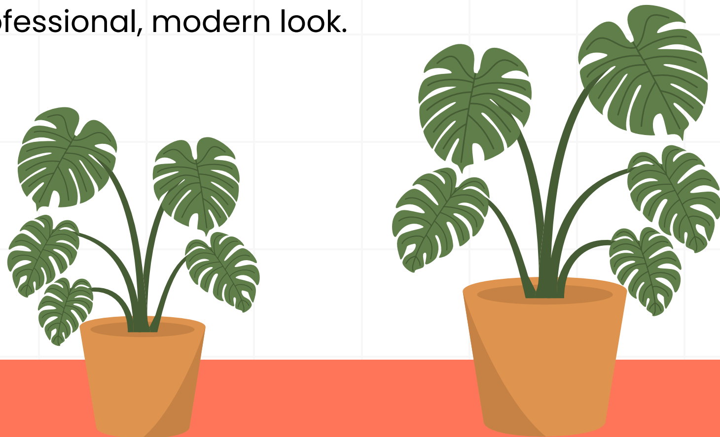
Table material affects aesthetics and durability. Choose materials such as wood, metal, or glass that are not only durable, but also provide a professional, modern look.